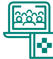
Pact for Skills and Digital Largescale Partnerships