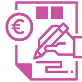
Digital Europe Programme