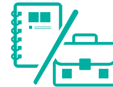
European Year of Skills